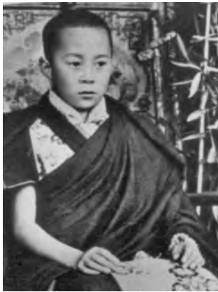
Early photo of His Holiness the 14th Dalai Lama

HIS HOLINESS THE 14TH DALAI LAMA OF TIBET, TENZIN GYATSO,